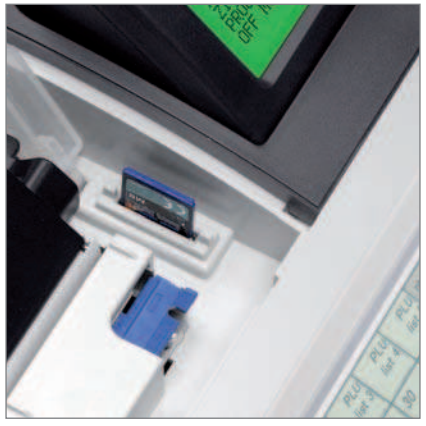
Slot for optional SD MEMORY CARD