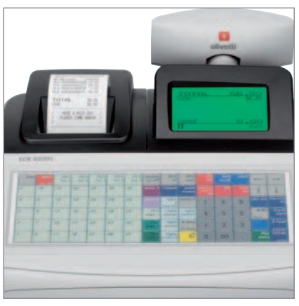
CUSTOMISABLE KEYBOARD with 35 plu keys for direct selection up to 105 items