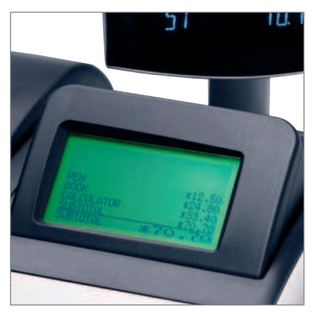
GRAPHICAL OPERATOR DISPLAY for immediate viewing of transaction details and easy system programming