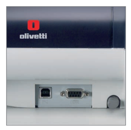
USB AND SERIAL PORTS for PC and scanner connectivity