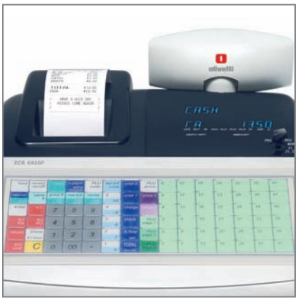
CUSTOMISABLE KEYBOARD with 42 PLU keys for direct selection of up to 126 items