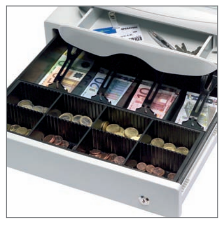
LARGE LOCKABLE CASH DRAWER plus additional DEPOSIT DRAWER