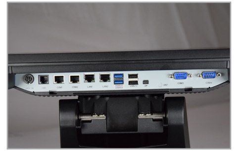
Easy access to communication ports